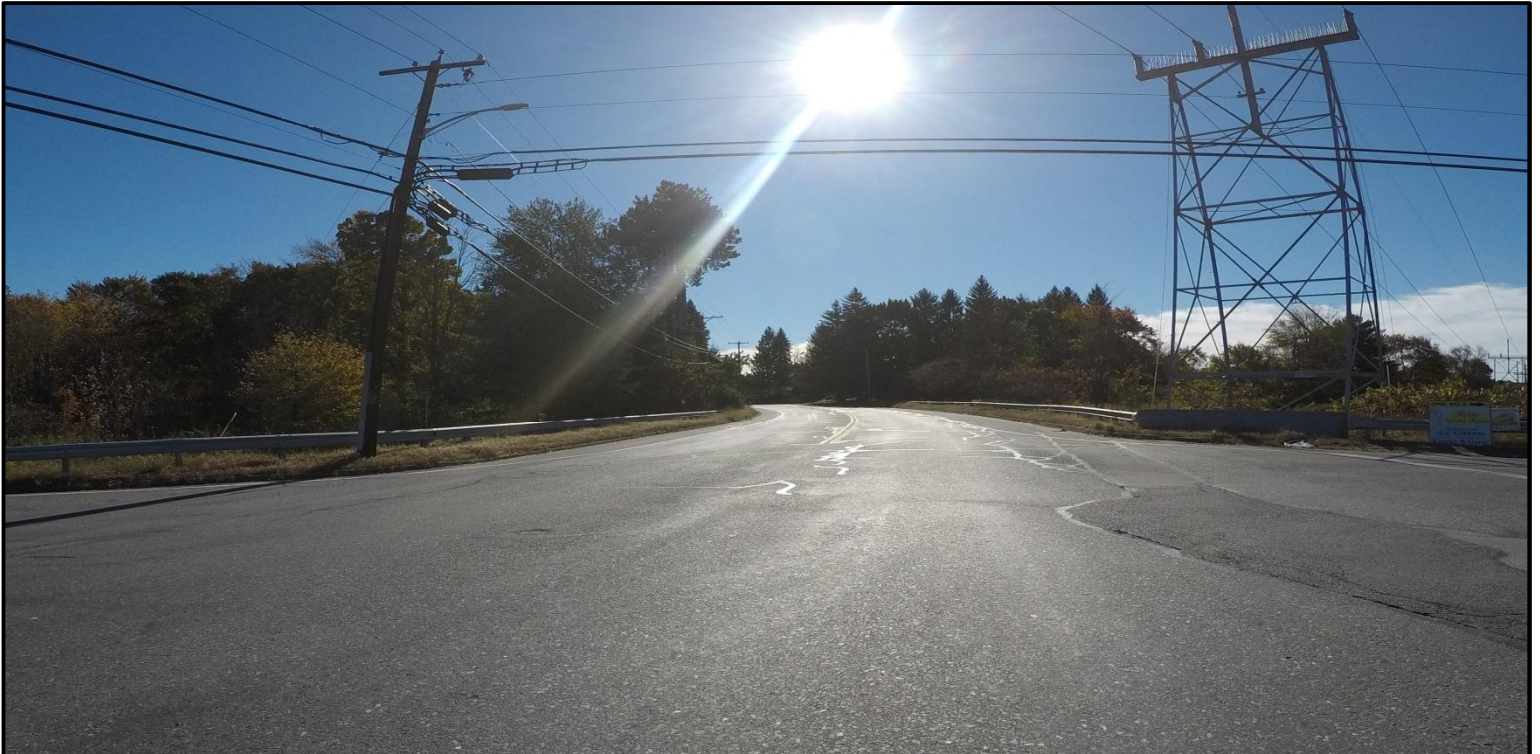
Street Name: Sterling Street | Segment ID: 04 | RSR: 78