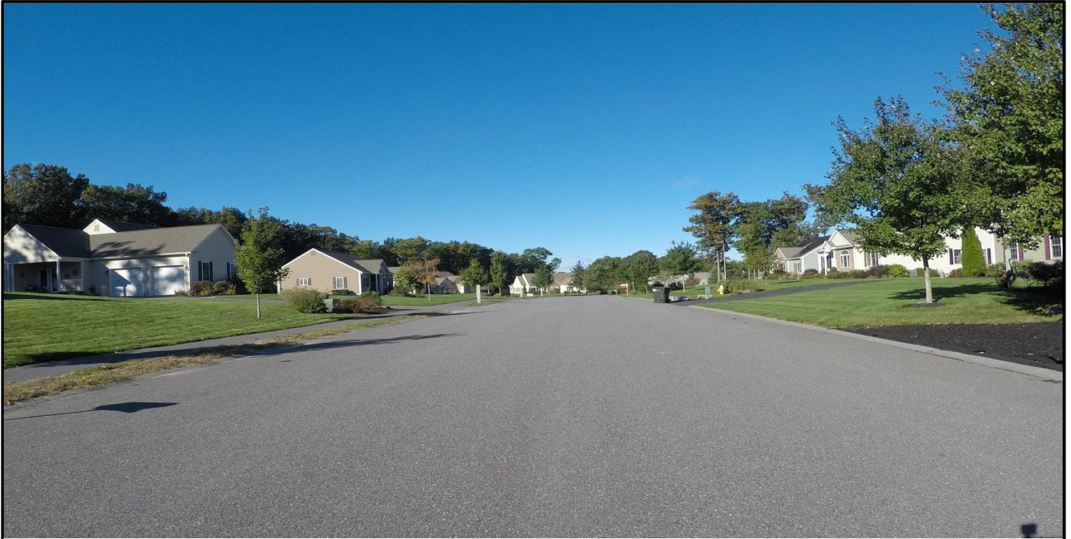
Street Name: Nicholas Drive | Segment ID: 01 | RSR: 96