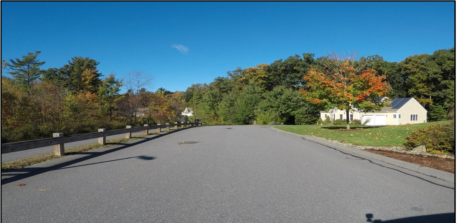
Street Name: Lindsey Way | Segment ID: - | RSR: 93