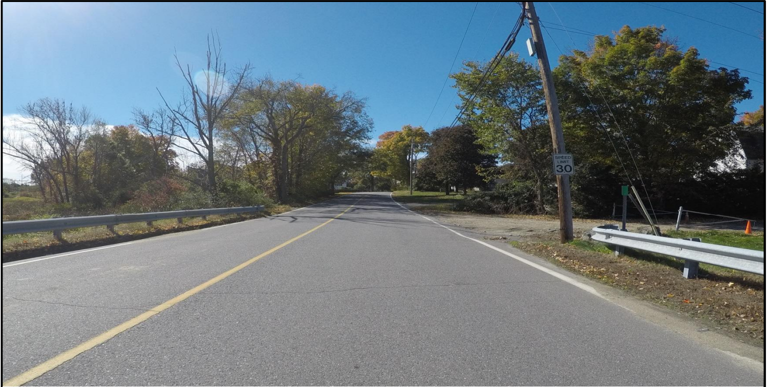
Street Name: Chace Hill Road | Segment ID: 02 | RSR: 91