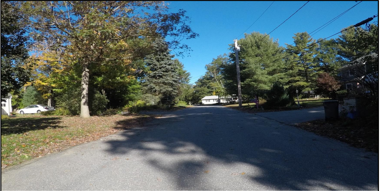
Street Name: Myles Standish Road | Segment ID: - | RSR: 82