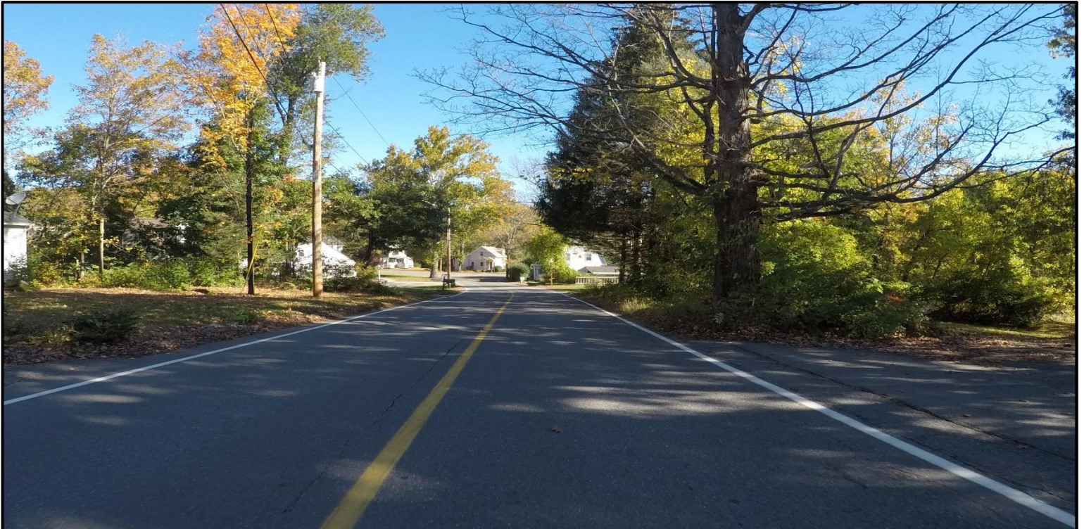
Street Name: Carter Street | Segment ID: 02 | RSR: 86