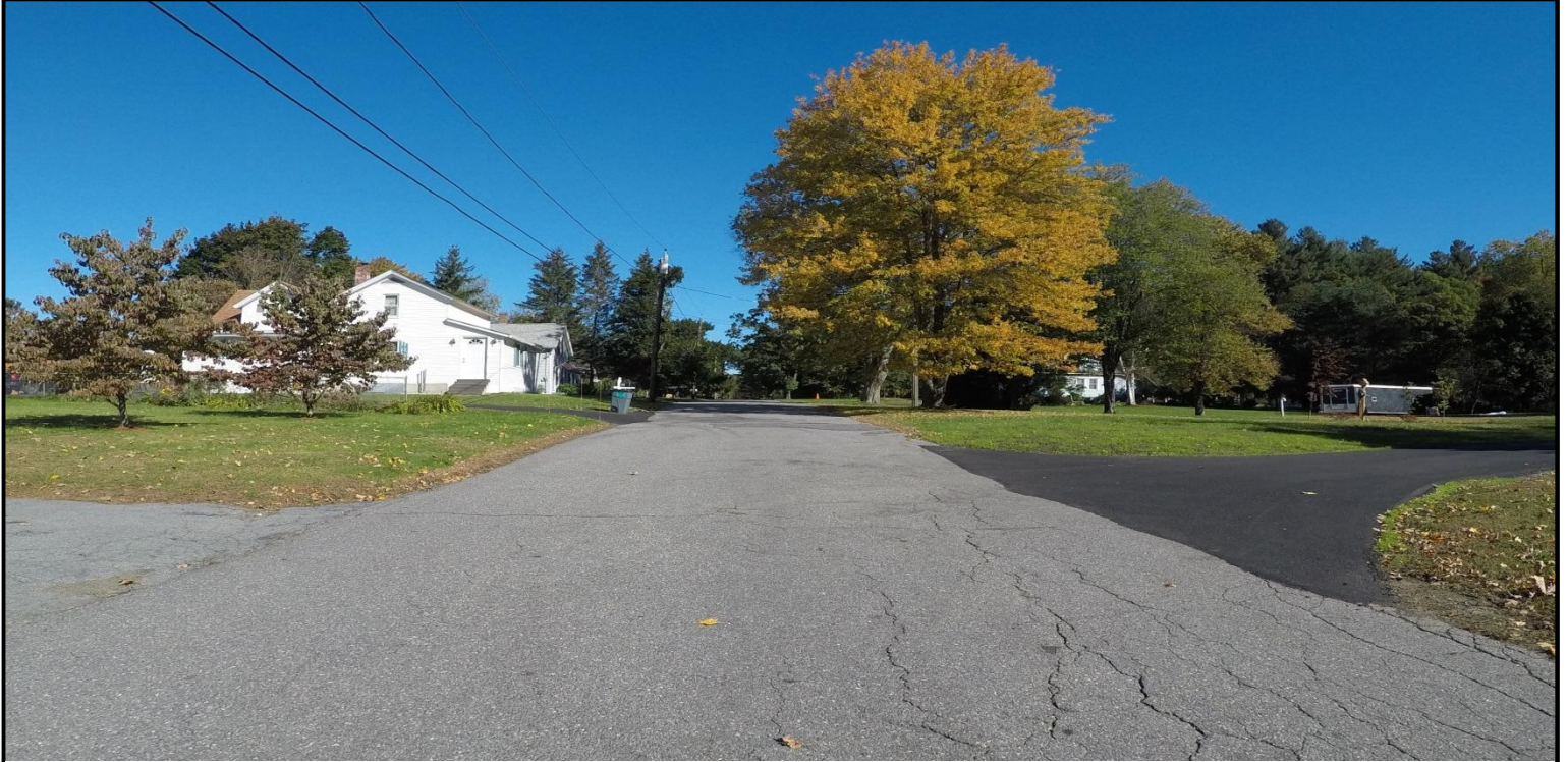
Street Name: Shirley Road | Segment ID: 01 | RSR: 73