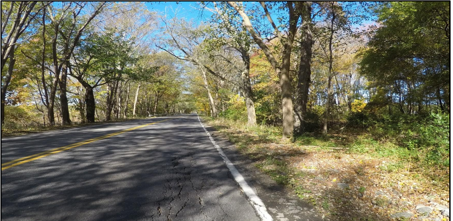
Street Name: Quincy Road | Segment ID: | RSR: 53