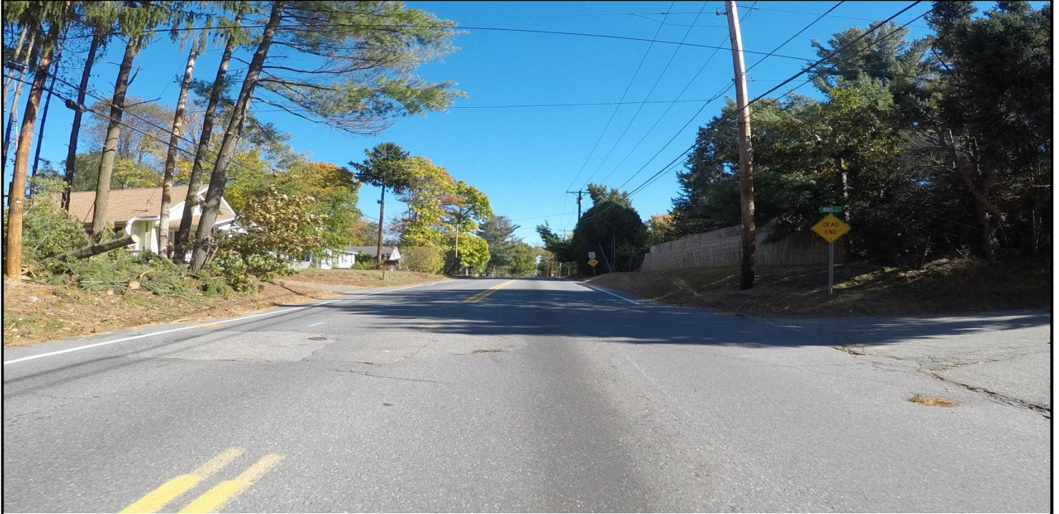
Street Name: High Street Ext | Segment ID: 05 | RSR: 60